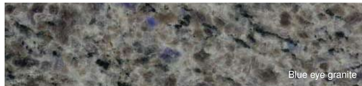
Blue eye granite